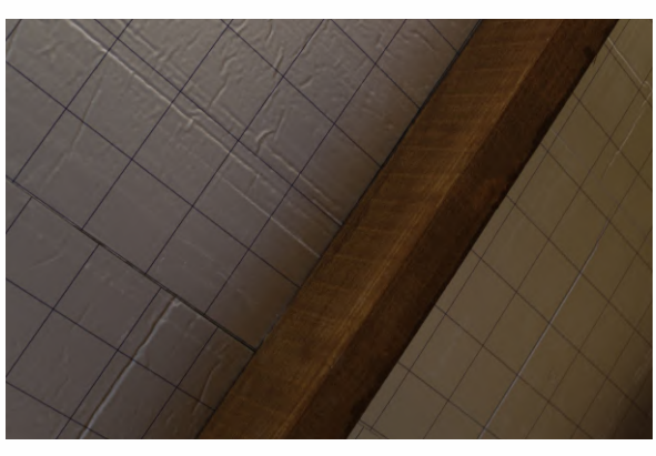
Photo 05 Roof view from inside without full boarding This requires finishing with, for example, dry plaster.